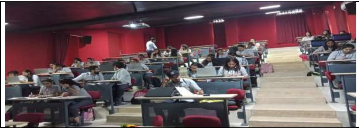
Students actively participating in the workshop